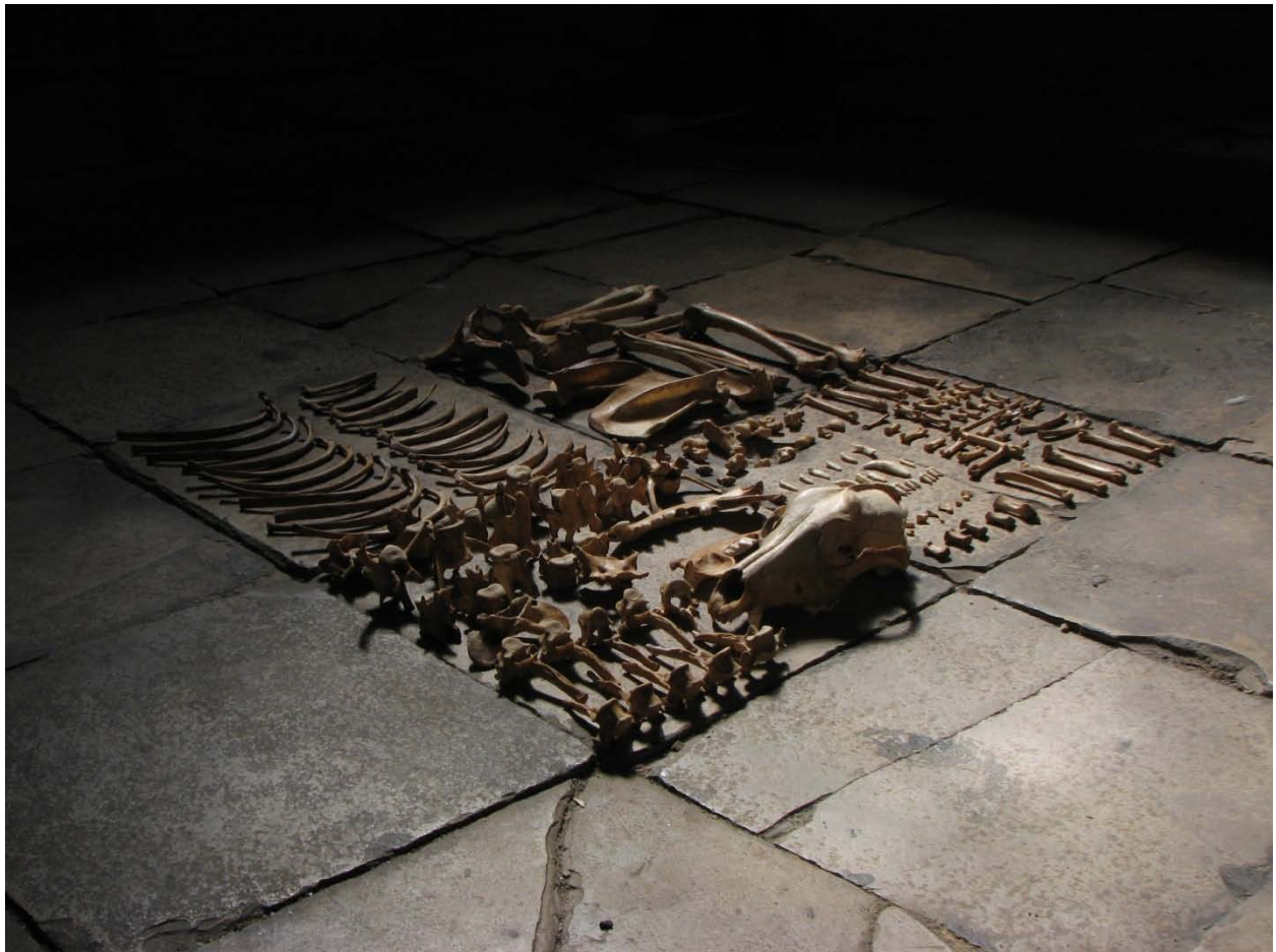
installation at Ferula space, Sibiu

The stray dog population in Bucharest is around 200.000, a human to dog ratio of 10 to 1. In the 1980's Nicolae Ceausescu had parts of the city torn down for building projects and many dogs were released into the streets. More than two decades later and the situation have grown out of control. I too feel, in this "new-born" Romania as a vagabond, as a stray dog. I am a child of the old system, wondering around in the present.